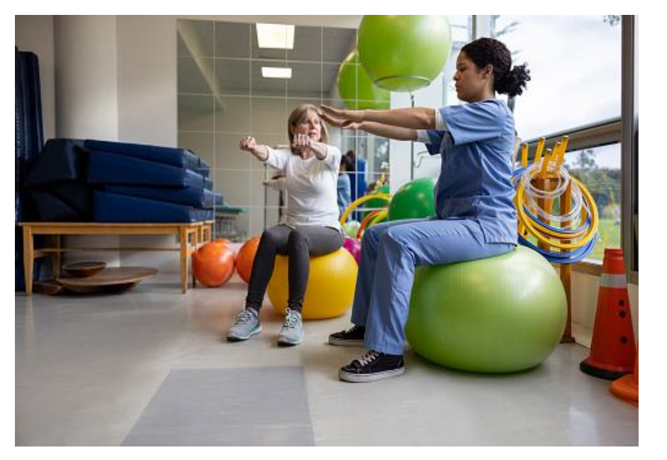
Educating the Military and their Families