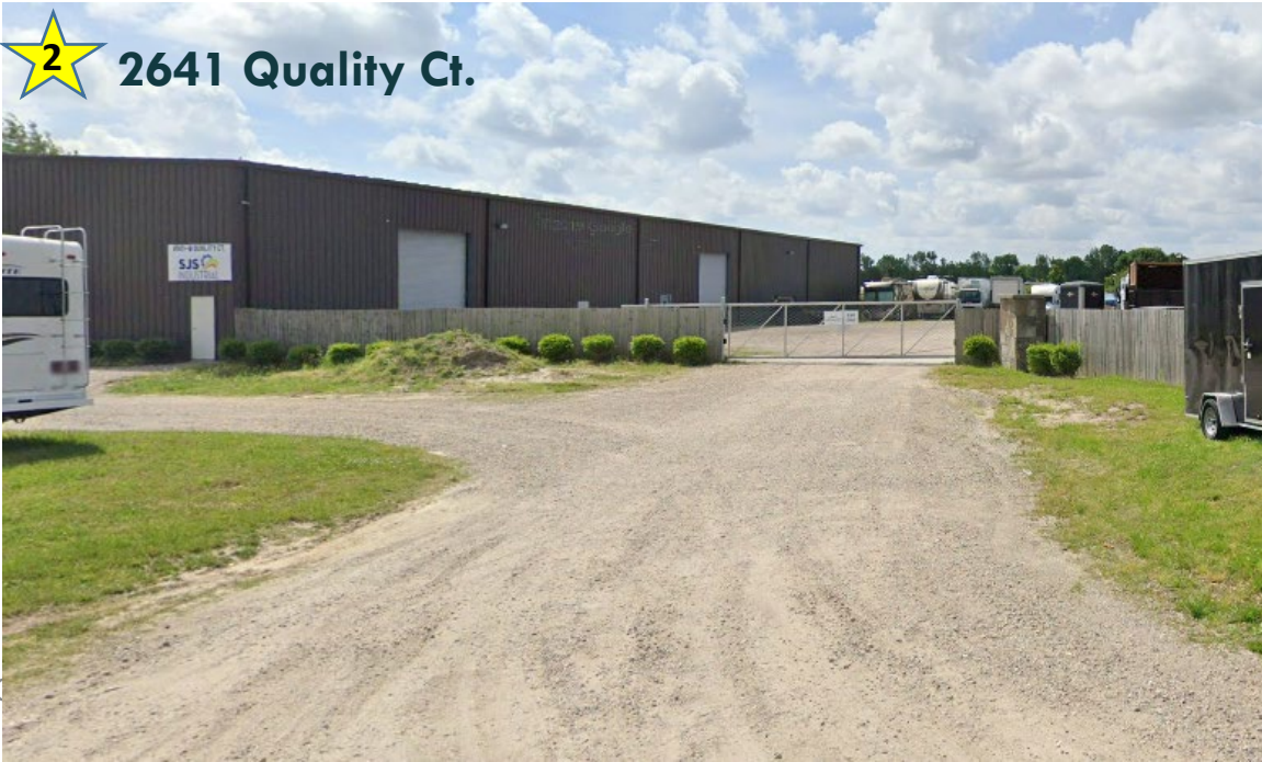
2 2641 Quality Ct.