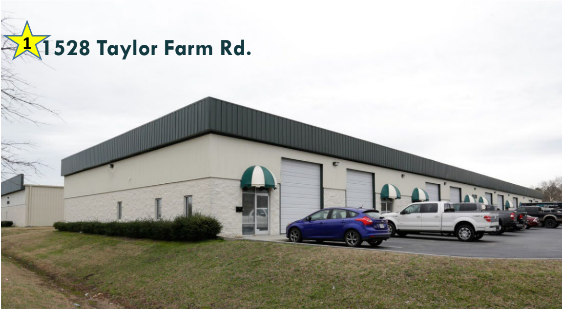
1 1528 Taylor Farm Rd.