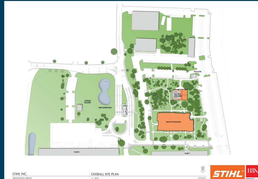
2017 Expansion of Headquarters Facility at 536 Viking Drive