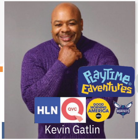
Perfecting Your Pitch

Attendees will get a big-picture view of marketing and close-up interactive opportunities to put these concepts to good use.