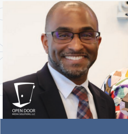
Marketing & Branding

Wednesday, April 17th, 2024 The HIVE in VB. 140 Independence Blvd. 23462